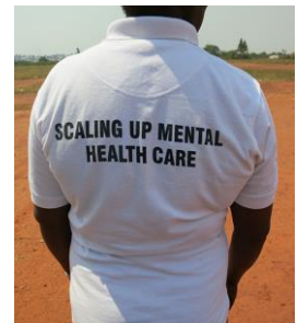
PRIME site visit to Uganda

There are a number of common elements which mark the PRIME implementation across the five countries: a common overall planning framework; high level of participation and engagement with local stakeholders; focus on community, health facility and health organisation levels; challenges of overburdened primary healthcare systems; and limited impact of training without systemic changes in the form of new mental health resources, sustained supervision, referral pathways, improved medication supply and reorientation of health facility managers.